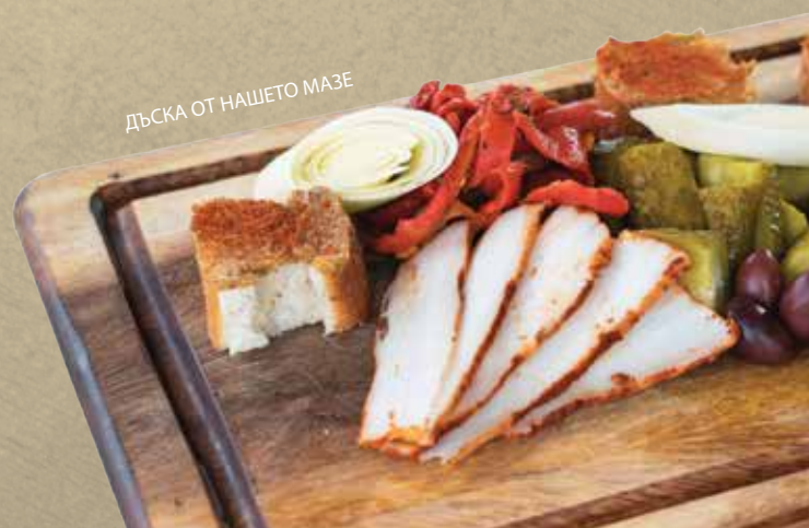
ДЪСКА ОТ НАШЕТО МАЗЕ