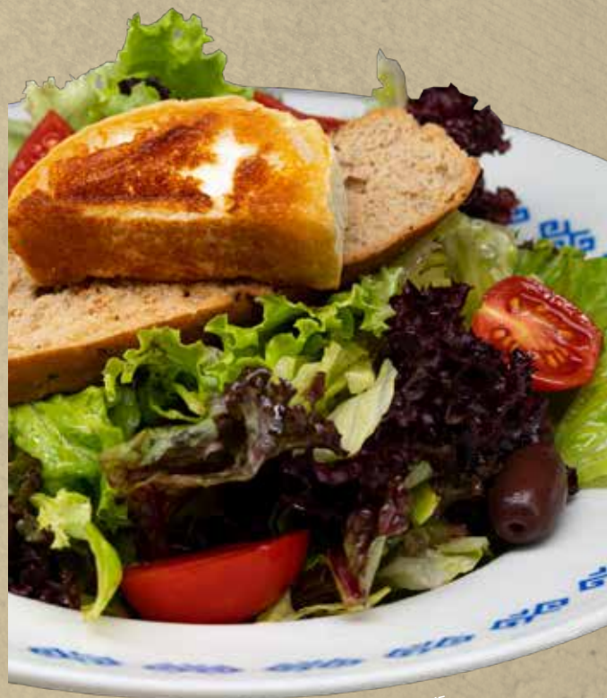
ЗЕЛЕНА САЛАТА СЪС ЗАПЕЧЕНО КОЗЕ СИРЕНЕ